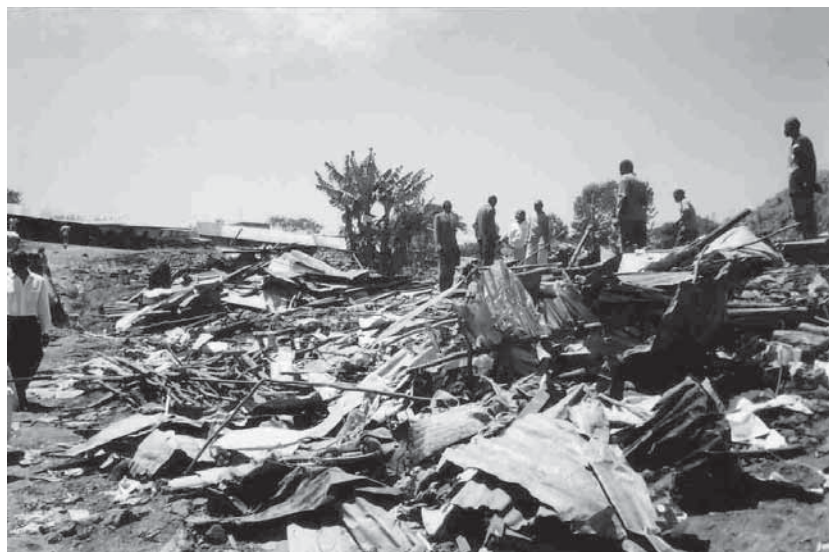
Photo: Christ the King, Catholic Church, Line Saba, Kibera.