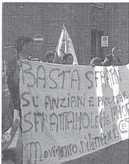
Sfratti sotto i riflettori Sul'emergenza casa c'è un'iniziativa internazionale